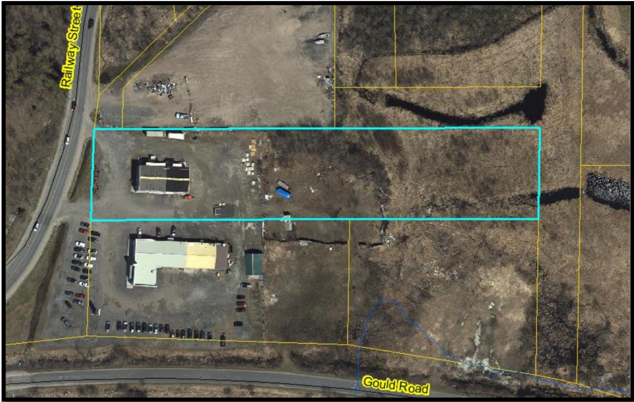
Figure 1: Subject property.