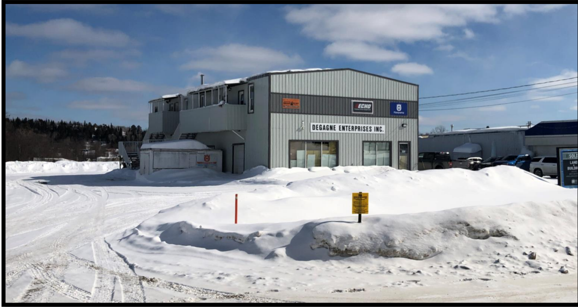
Figure 2 – View of property from Railway Street.